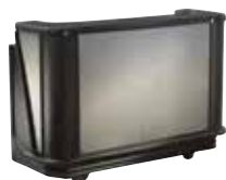
Chicago (770) Black Base, Coal Counter top with smooth Brushed Pewter Panels