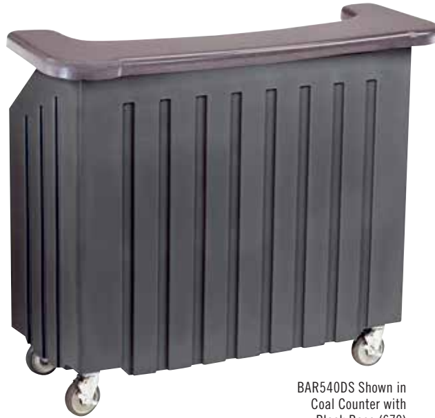
BAR540DS Shown in Coal Counter with Black Base (670)