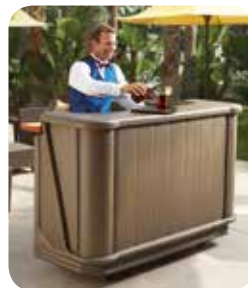
BAR650 shown in Standard Decor