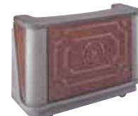
Sedona (668) Granite Sand Base, Cocoa Counter top with Light Burlwood Panels