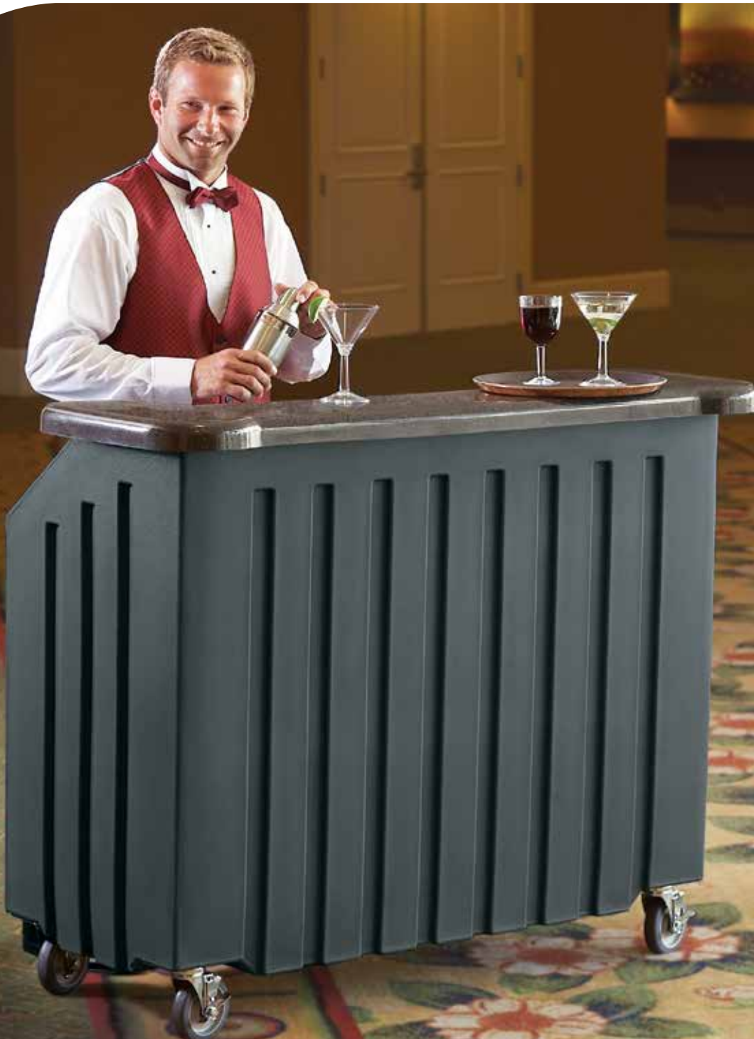
BAR540 Shown in Designer Decor Granite Gray Base with Coal Counter (100) Special Request.

Offering a professional presence to the customer with an efficient serving area for the operator, BAR540 is the best choice for off site catering and events with limited space.