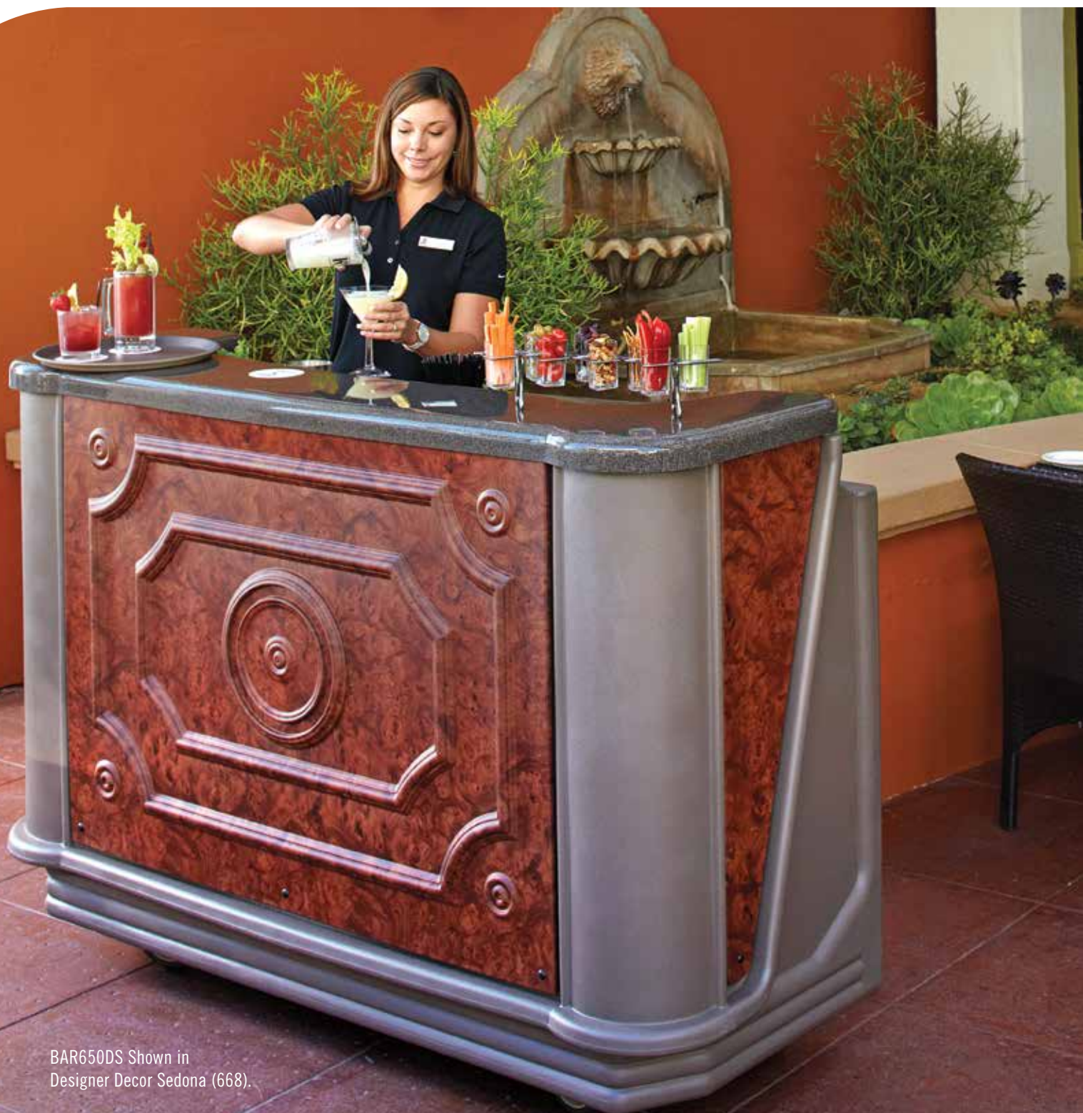
BAR650DS Shown in Designer Decor Sedona (668).

Easy to manage for off-site catering as well, BAR650 is ideal for small to mid-size functions.