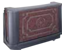
Carmel (669) Black Base, Coal Counter top with Dark Burlwood Panels