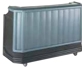
LARGE MODEL BAR730