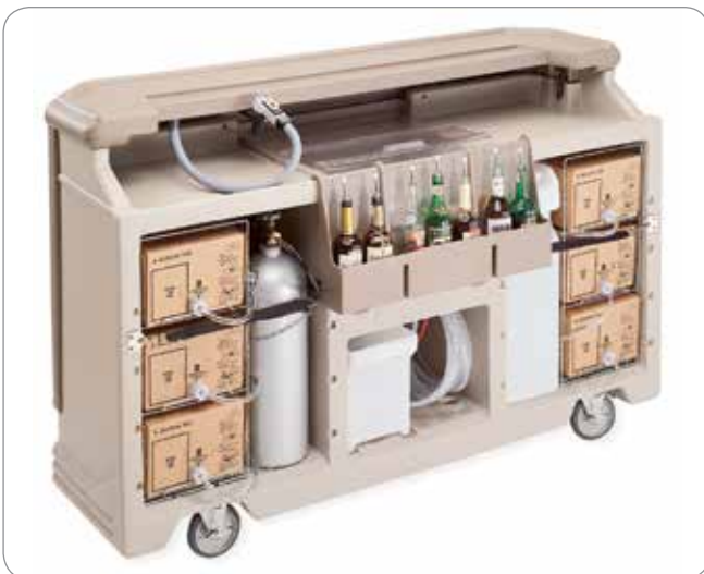
Excellent functionality speeds service.