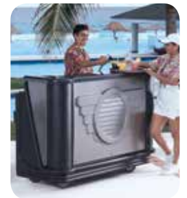
BAR650 shown in Manhattan Designer Decor Package