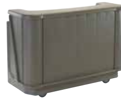
MID-SIZE MODEL BAR650