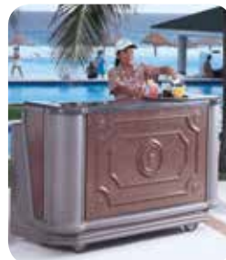
BAR730 shown in Carmel Designer Decor Package