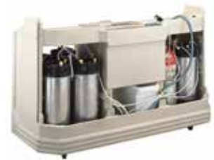
BAR730 front panel removal