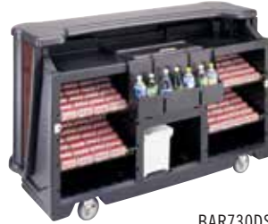
BAR730DS (shown with four optional wire racks)

L 77½" x W 28½" x H 47½" (L 197,2 x W 72,4 x H 120,7 cm)