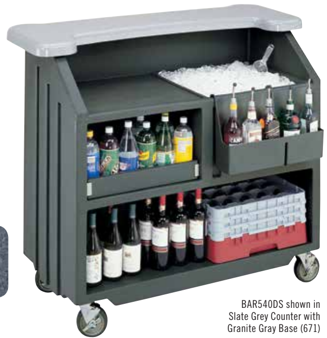
BAR540DS shown in Slate Grey Counter with Granite Gray Base (671)

Casters: All BAR540 Models - Four 5" (12,7 cm) swivel, two with brake.