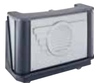
Manhattan (667) Black Base, Coal Counter top with Brushed Pewter Panels