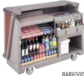
BAR650DS (shown with two optional wire racks)

L 67½" x W 28½" x H 47½" (L 171,5 x W 72,4 x H 120,7 cm)