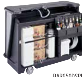
BAR650DSPMT (Shown with water tank and bag-in-box rack.)