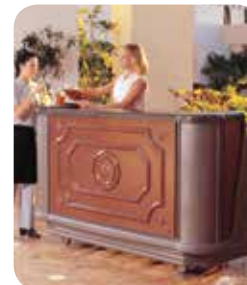
BAR730 shown in Sedona Designer Decor Package