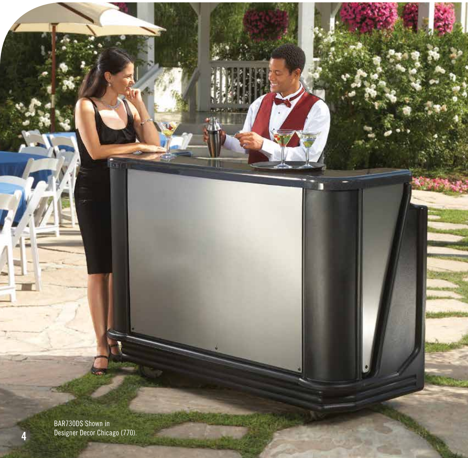
BAR730DS Shown in Designer Decor Chicago (770).

BAR730 pours on a double-shot of style with a variety of designer decor options to create a more dramatic, upscale ambience in traditional or contemporary environments.