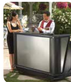
BAR650 shown in Chicago Designer Decor Package